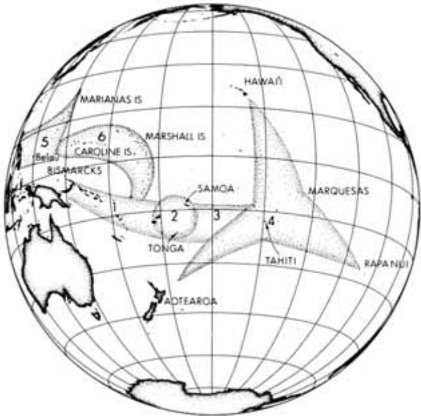
FIGURE 3. Main Austronesian migrations into the Pacific: (1) from the Bismarcks to the mid-Pacific archipelagos of Fiji, Tonga, and Samoa; (2) the “homeland” of the Polynesians, now known as West Polynesia; (3) from West Polynesia to central East Polynesia; (4) from central East Polynesia to Hawai‘i, Rapa Nui, and Aotearoa; (5) from the Philippines to the western edge of Micronesia; (6) from the main migration sequence north to Micronesia and then west across the region.

The ocean-going canoe was the vehicle that Austronesian speakers employed to expand across the South Pacific and then to find and settle every habitable island in Polynesia, a vast triangular region equivalent in size to much of Europe and Asia combined. Austronesian canoe voyagers also colonized that region of Remote Oceania east of the Philippines and north of New Guinea, known as Micronesia because of the small size of the islands there. Some migrants evidently crossed to western Micronesia