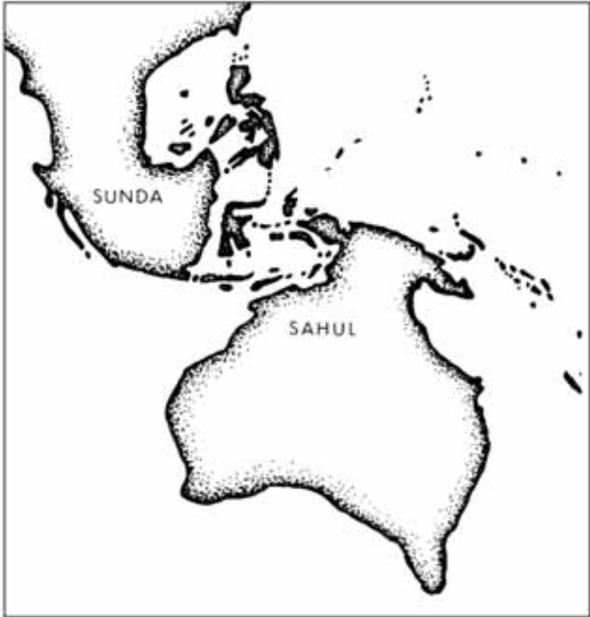
FIGURE 2. Sunda and Sahul at the height of the last glaciation, when the sea level was more than 100 meters below that of today.

tary form of watercraft—perhaps rafts of bamboo or wood, or dugout canoes. With the right combination of wind and current, plus perhaps some paddling, adventurous groups made it across the glacially narrowed gaps between Sunda and its offshore islands and Sahul. Nonetheless, however simple the technology, reaching Sahul was a major step in humankind's spread over the globe. A clustering of sites in Australia that have been radiocarbon-dated in the range of 30,000-plus years B.P., along with other sites from New Guinea and Australia dated by other means at between 40,000 and 60,000 years B.P., indicates that Sahul was settled well back in the Pleistocene. It thus represented the first step