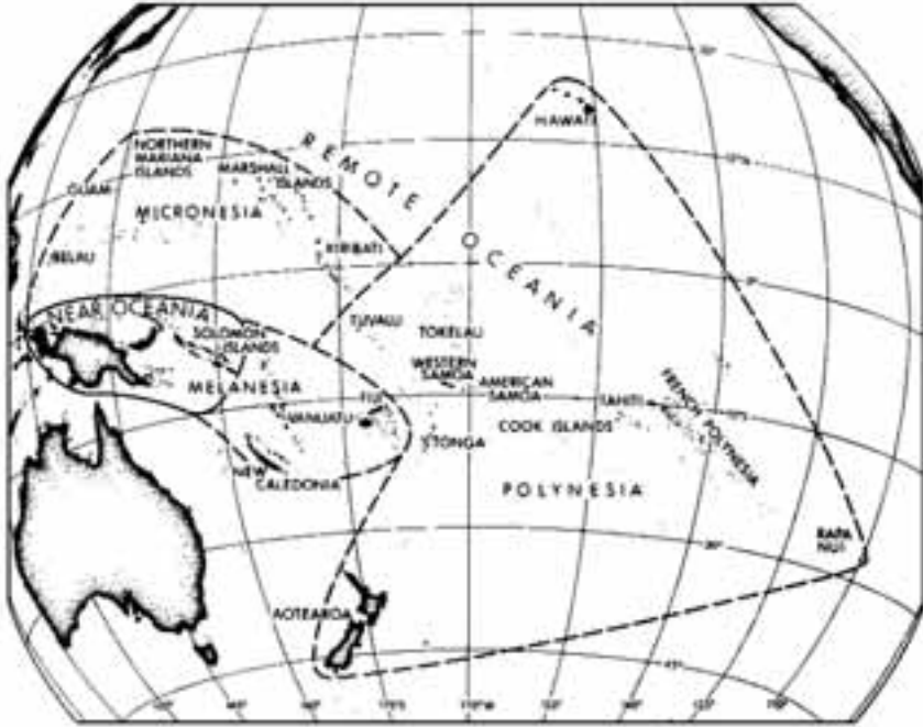
FIGURE 1. Oceania, showing the conventional geographical division into Melanesia, Micronesia, and Polynesia, and the more prehistorically significant division into Near Oceania and Remote Oceania.

chain of intervisible, or nearly intervisible, land masses separated by only short ocean gaps. Remote Oceania consists of a large number of archipelagos and islands beyond Near Oceania. This is where the open Pacific begins: distances between the islands and archipelagos of Remote Oceania can reach hundreds of miles, and in a few cases thousands of miles.